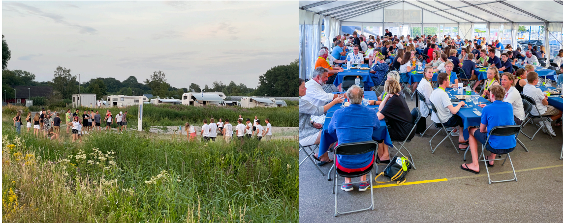
Social gathering after sailing at RJK

This structure ensures social cohesion, quality, and memorable evenings for all participants.