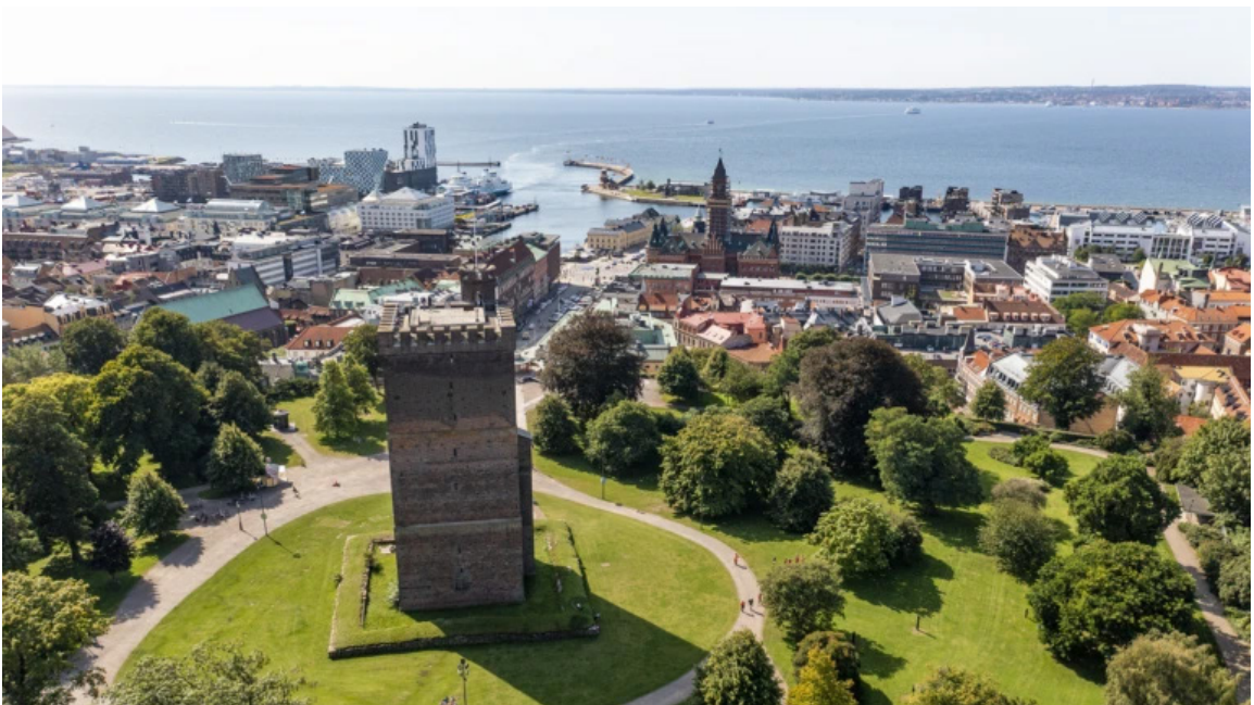
Helsingborg city center with the 700-year-old defense tower Kärnan in the foreground