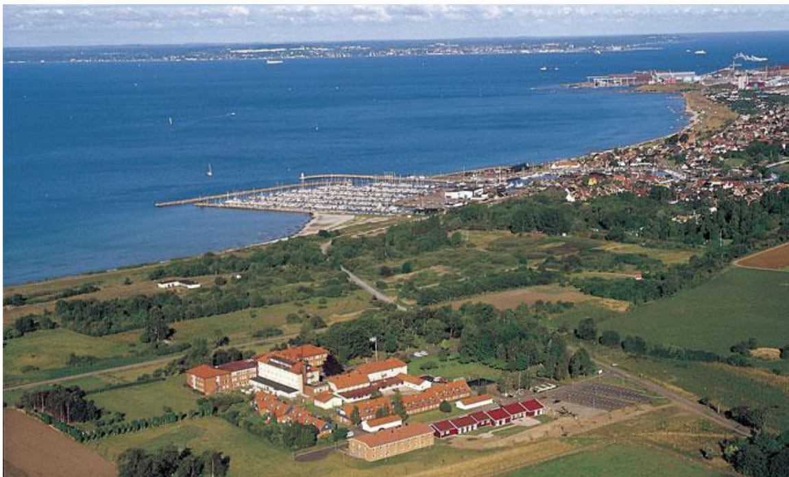
Sundsgården hotel in the forefront with Råå harbor in the center and Elsinore with the famous castle Kronborg in the background