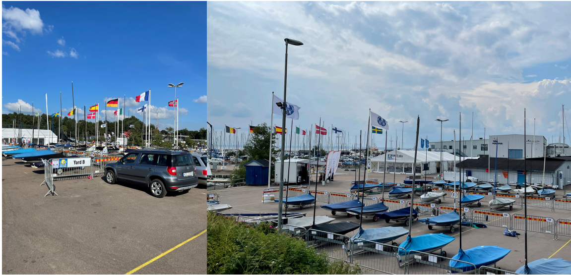
Råå harbor and boat park area