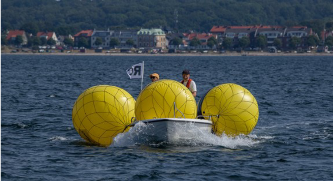
Race committee on the water with Råå in the background