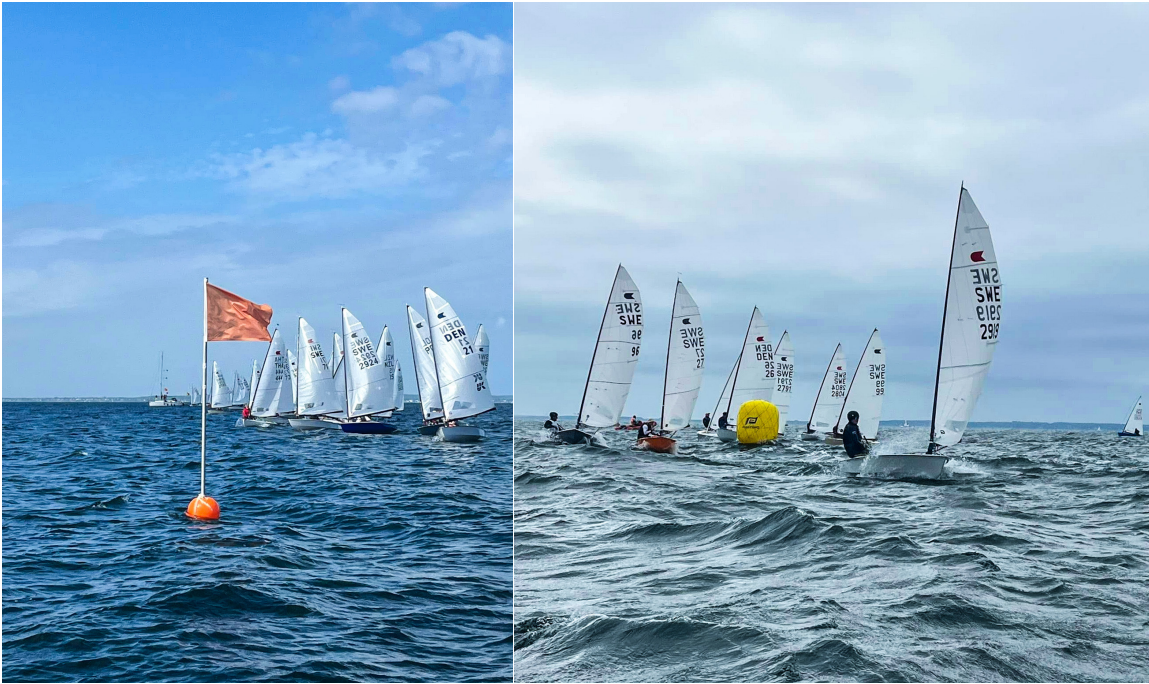
OK dinghies racing in the waters outside Råå